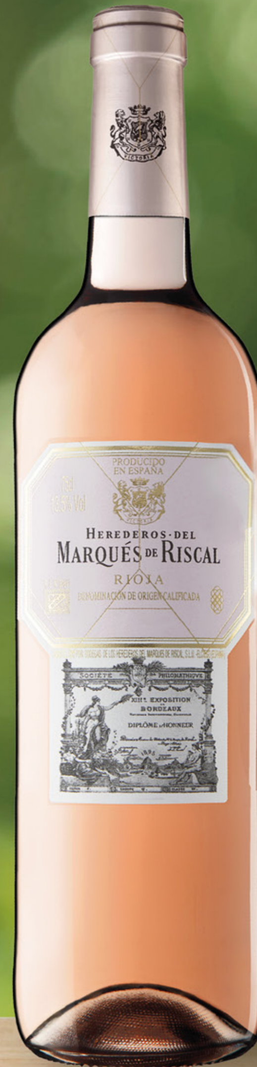
image represents a wine born of the land, of its roots, a sustainable, fine quality wine.

This rosé is made by pressing in line with a concept of classicism and refinement, producing a delicacy, freshness and smoothness which are rare in this type of wine.